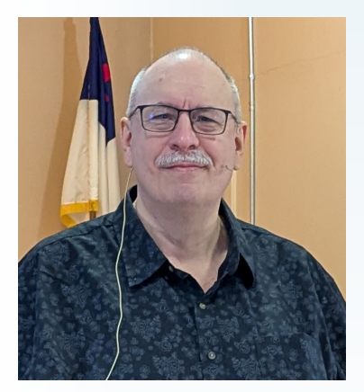
Helping non-profits and churches align with and achieve their mission

If you have a gospel centered ministry but limited resources, 'Equip The Saints' mission can provide consulting resources to help you get started or become more effective. (Equip the Saints is a ministry of InFaith)